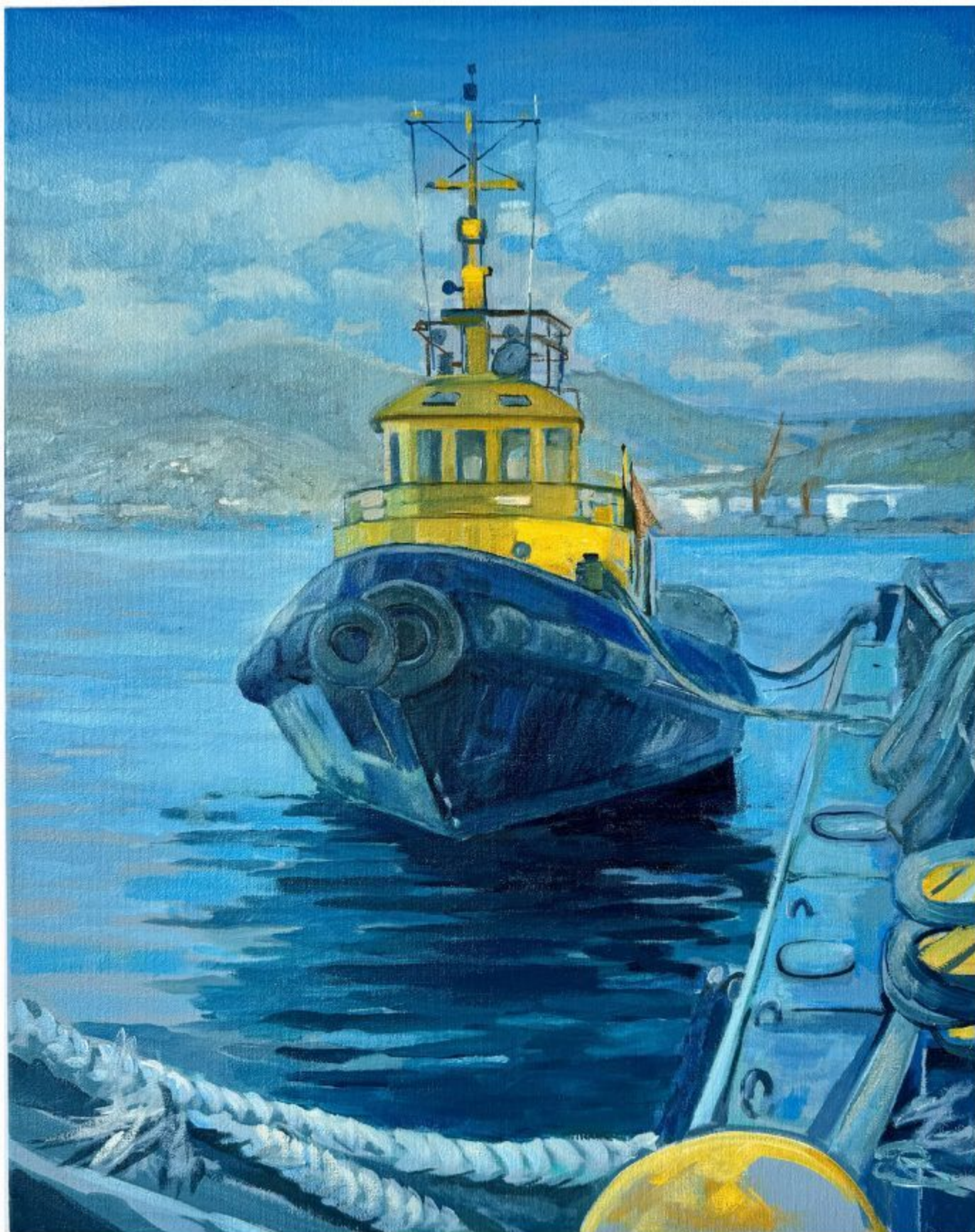
Hello barge, 40×50, oil on canvas 2024