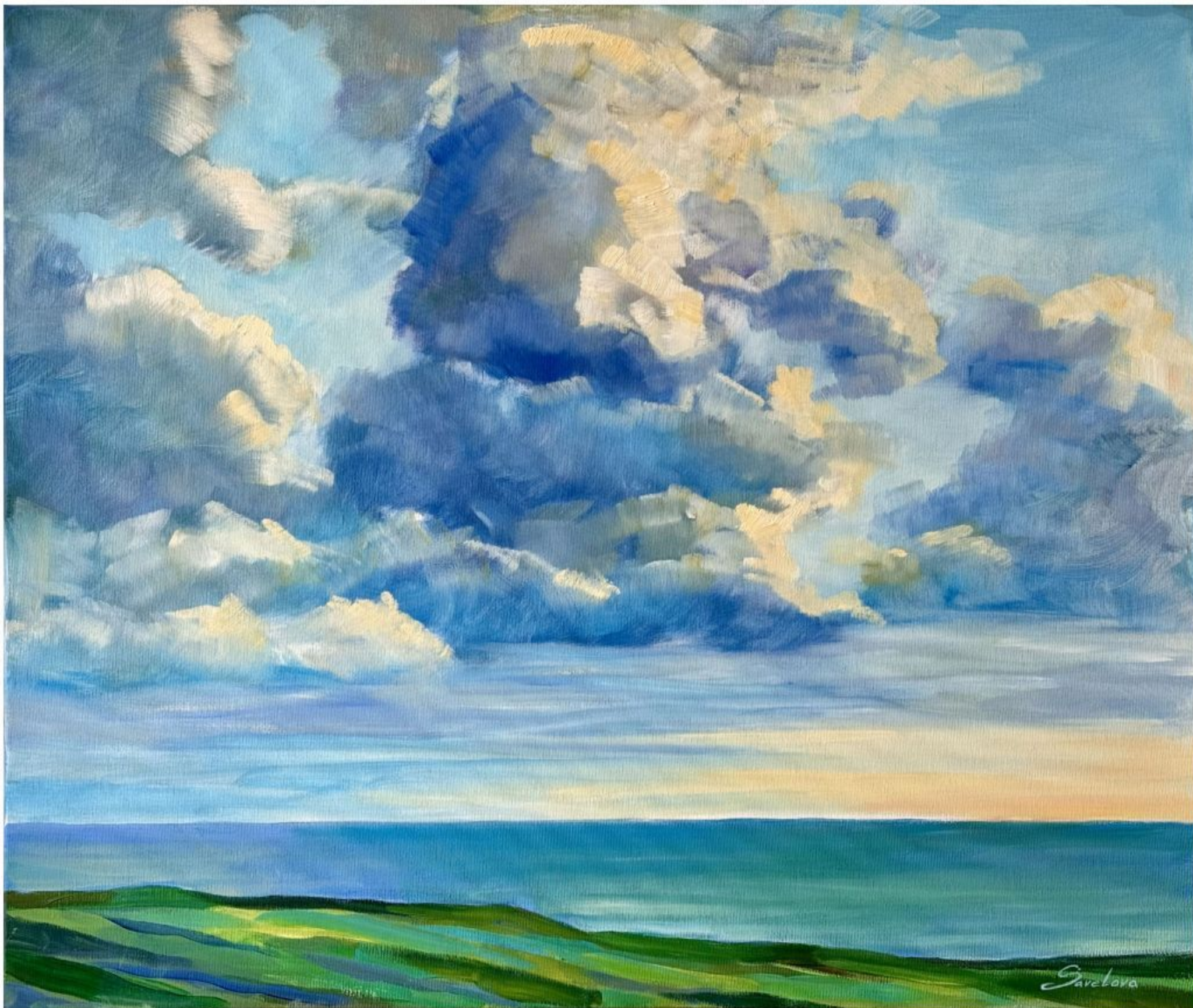
Fluffy clouds 70×60 Oil on canvas 2023