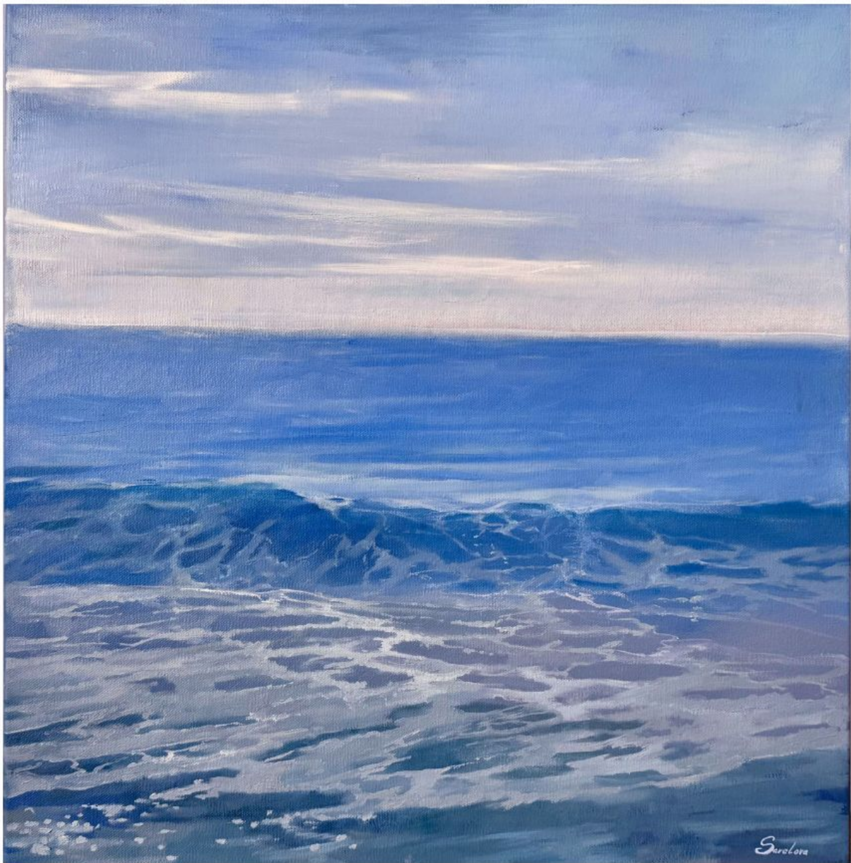
Blue sea wave 50×50 Oil on a canvas 2023