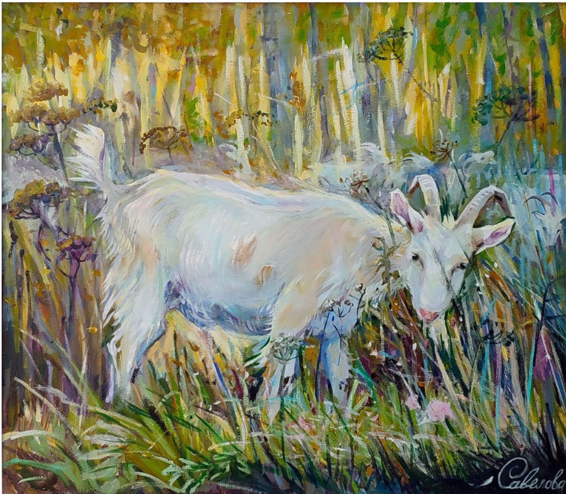
Goat mother 70x60 Oil on canvas 2020