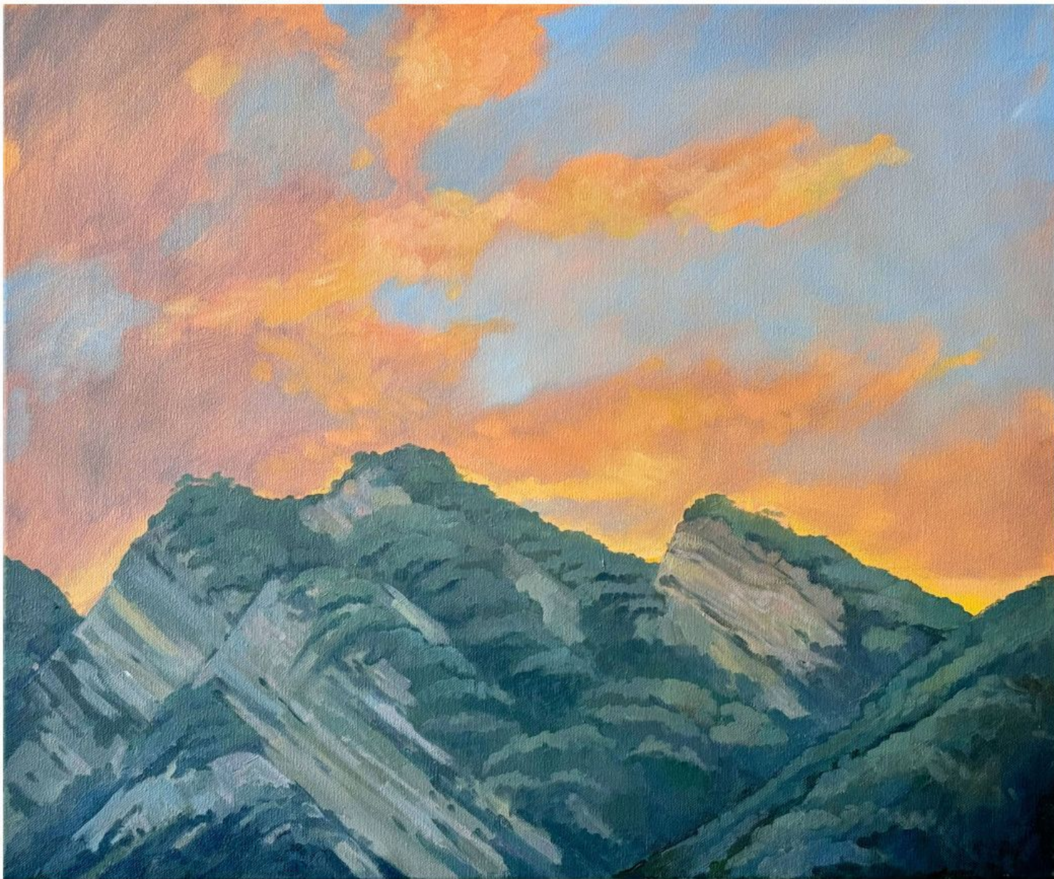
Black Rock 60×50 Oil on canvas 2023