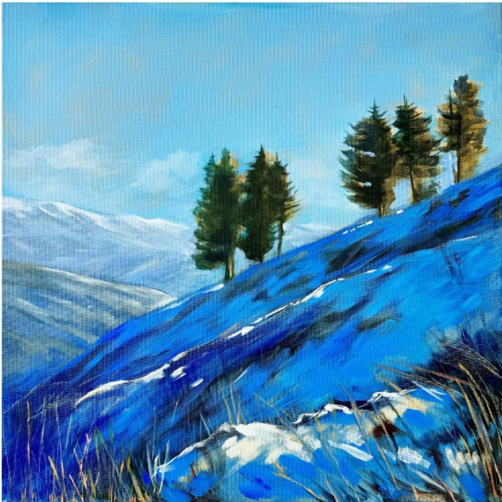
Six sisters 60×60 Oil on canvas 2023