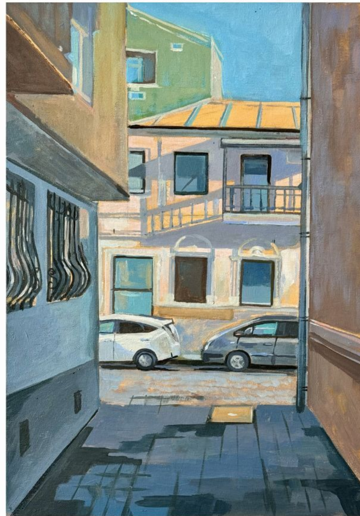
Tennis street, 25×25, oil on canvas 2023