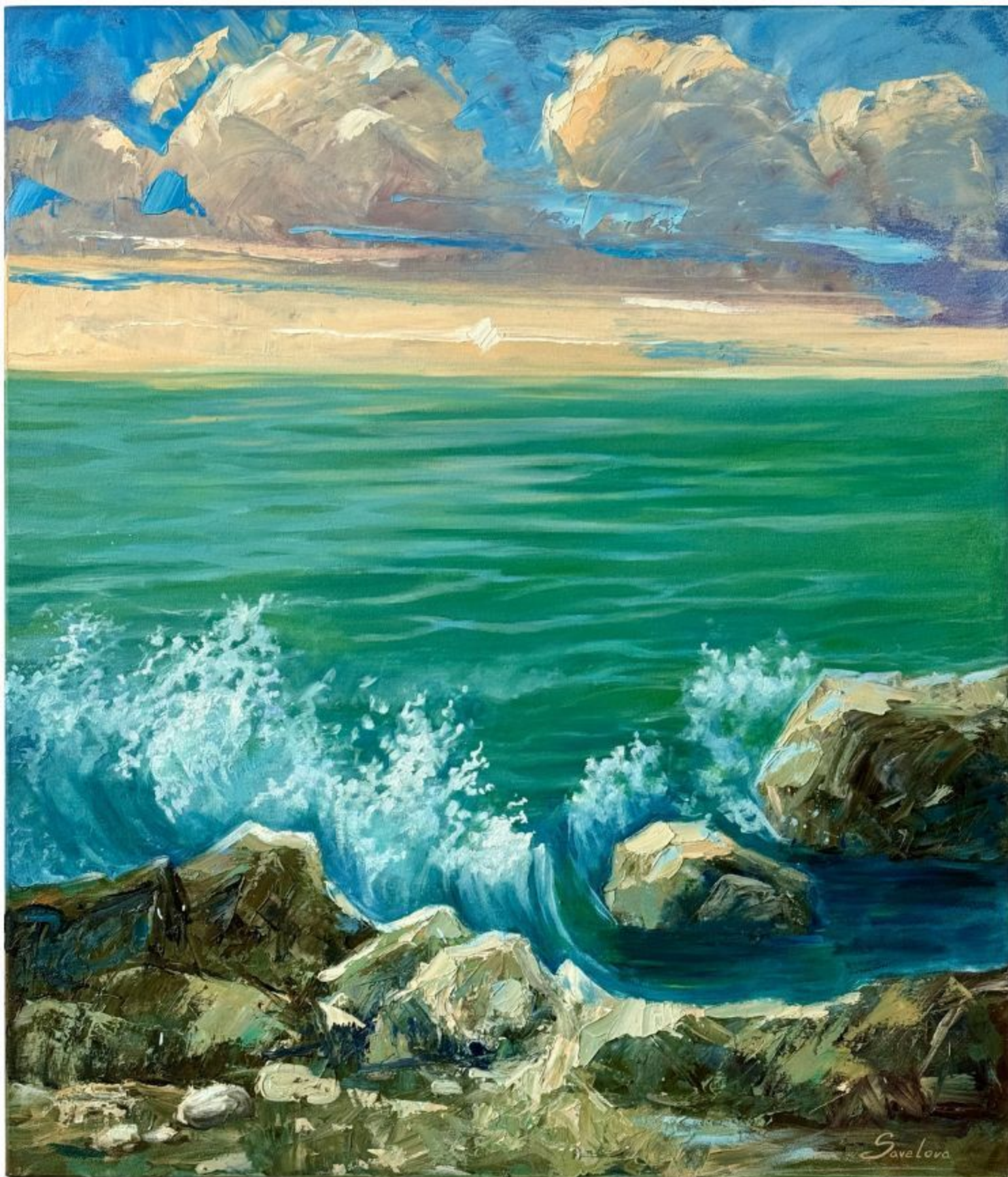
Green sea 60×70 Oil on canvas 2023