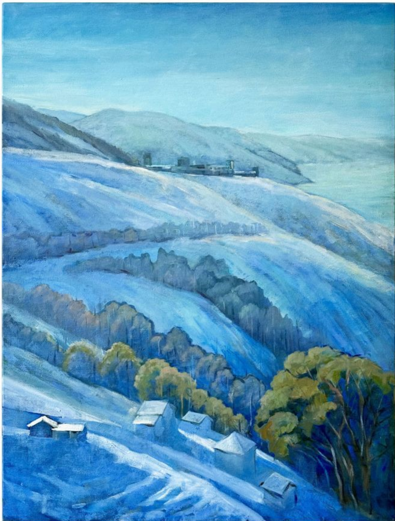
View of Sarpi 60×80 Oil on canvas 2023