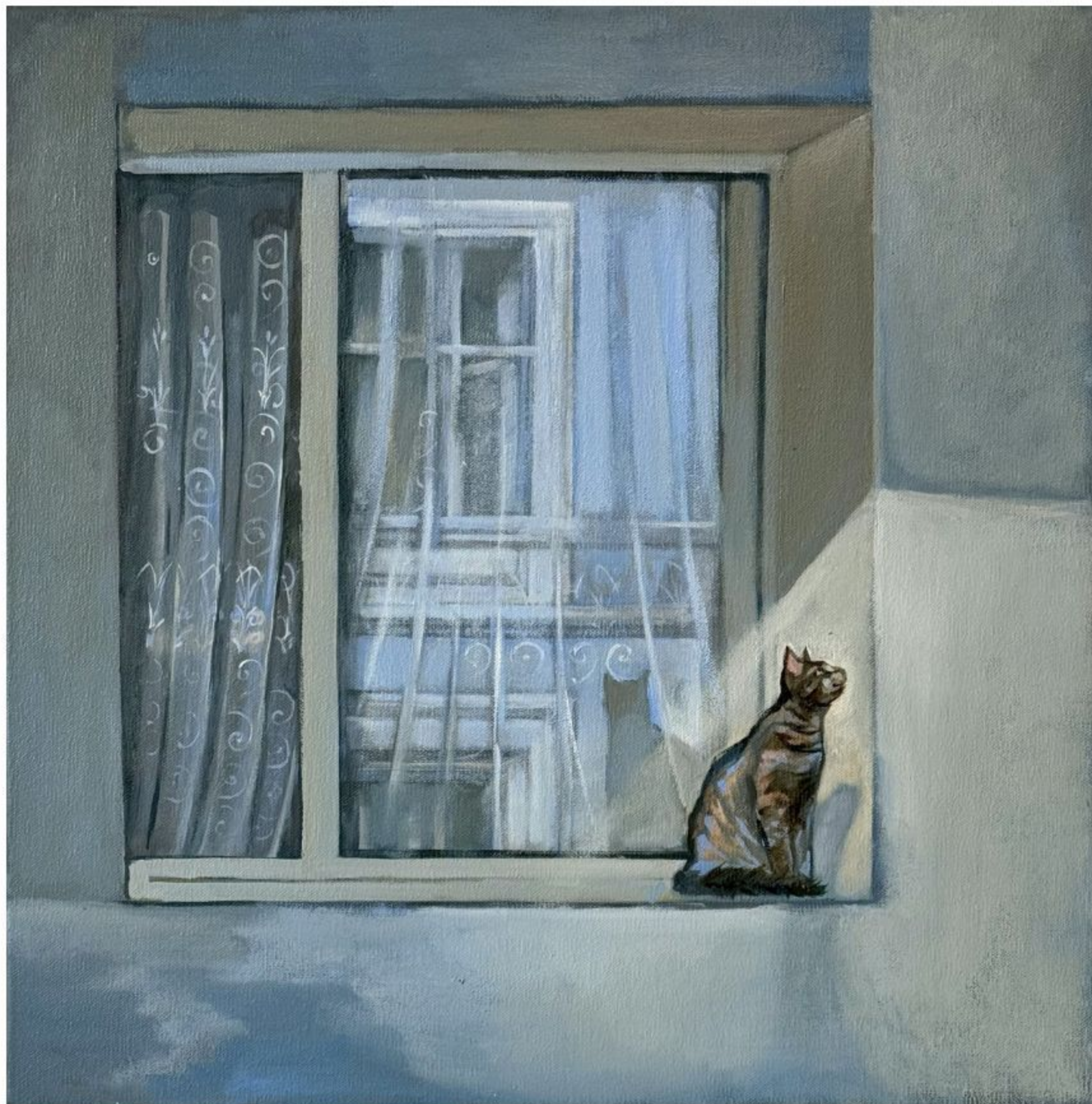
Window 50×50 Oil on canvas 2024