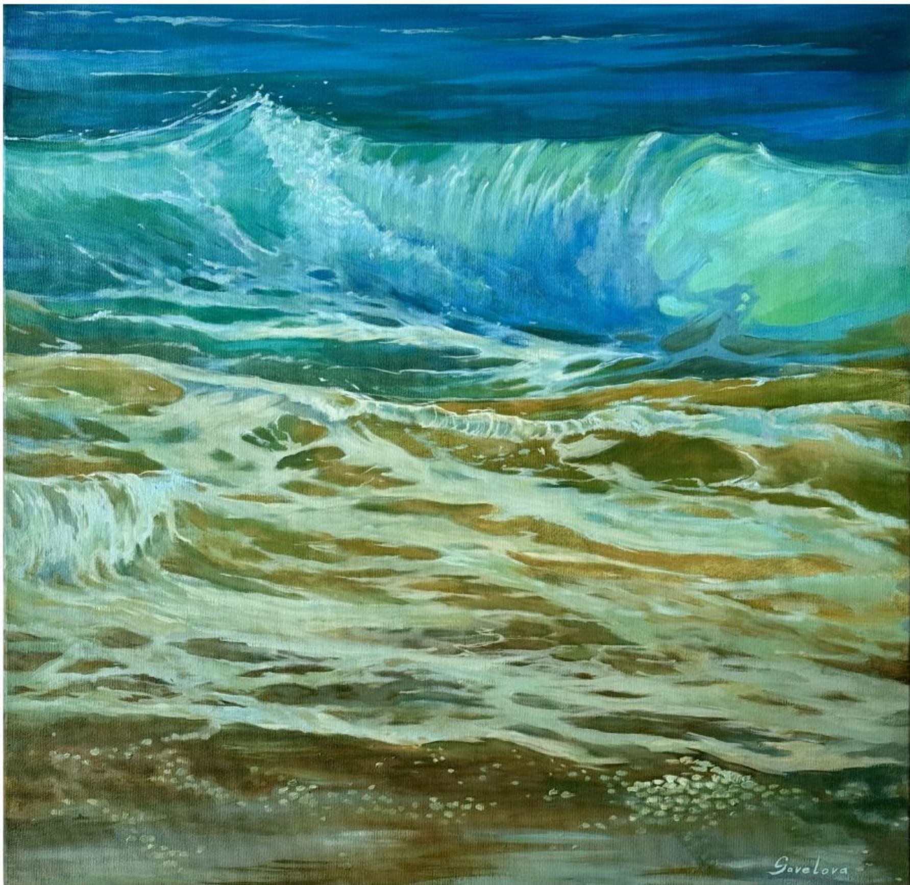
The wave 60×60 Oil on canvas 2023