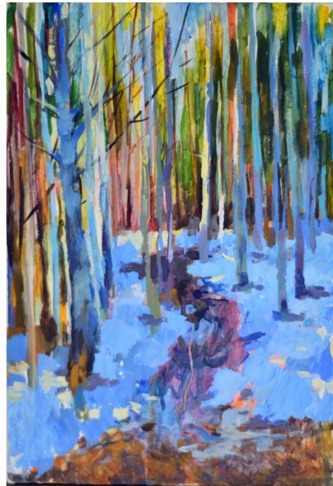
Young forest, 20x30, oil on canvas panel 2019