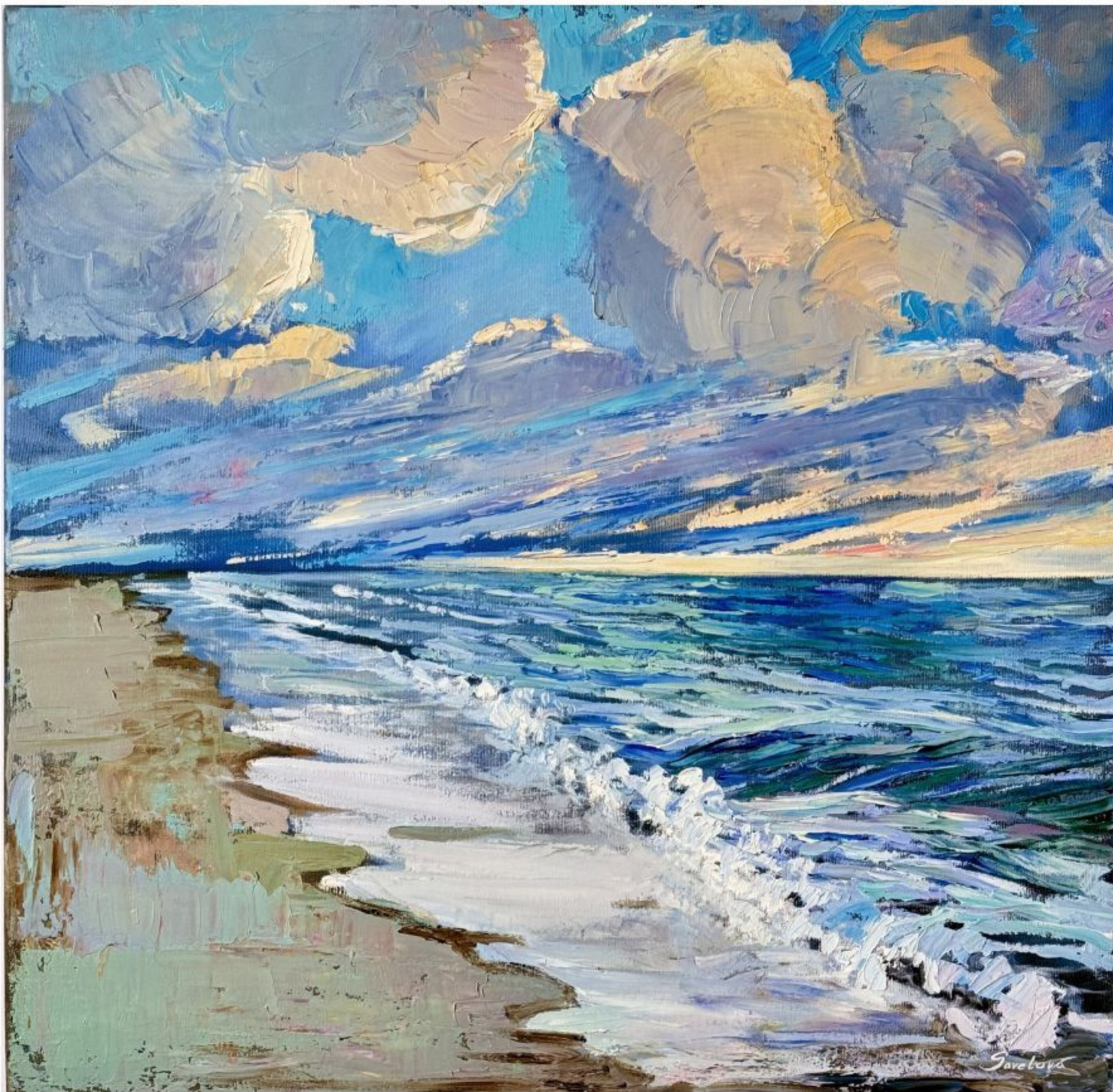
Sea coast N2 60x60 Oil on canvas 2023