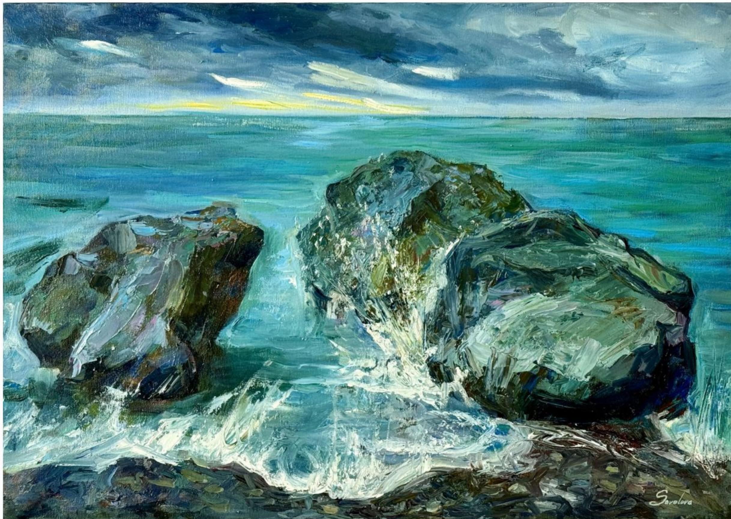
Three sea rocks 50×35 Oil on canvas 2023